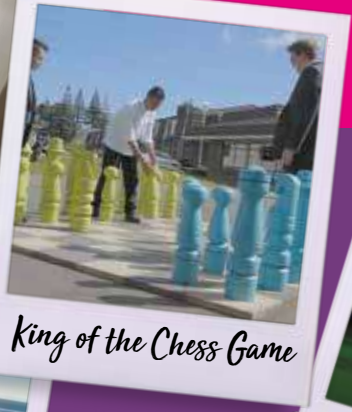
King of the Chess Game