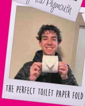
THE PERFECT TOILET PAPER FOLD