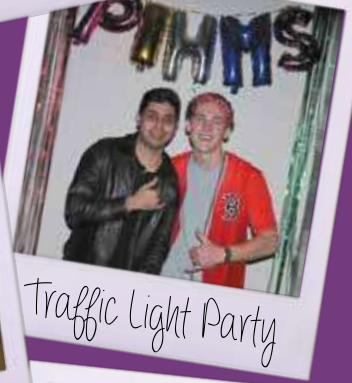
Traffic Light Party