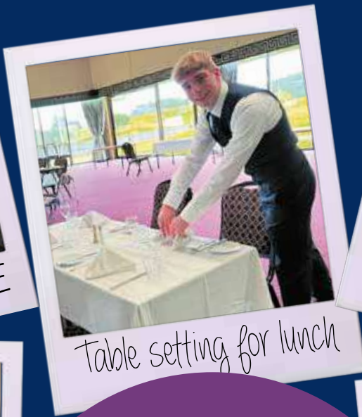
Table setting for lunch