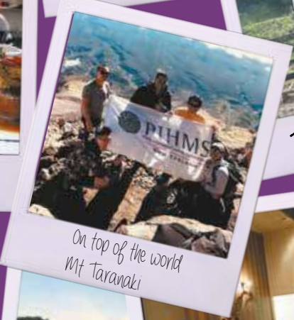
On top of the world Mt Taranaki