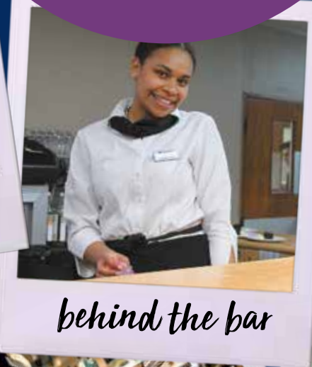
behind the bar