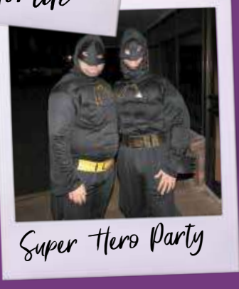
Super Hero Party