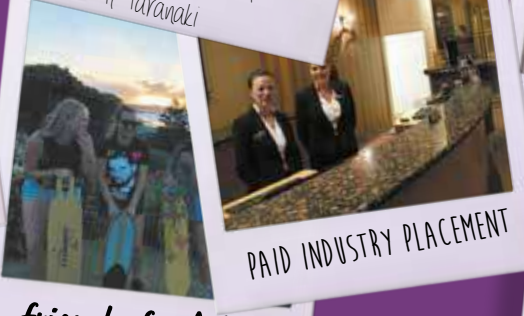
PAID INDUSTRY PLACEMENT