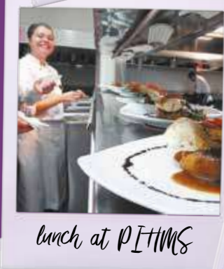
lunch at PIHMS