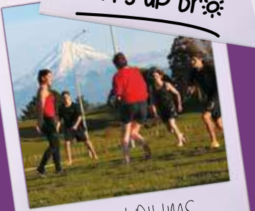
Sports at PIHMS