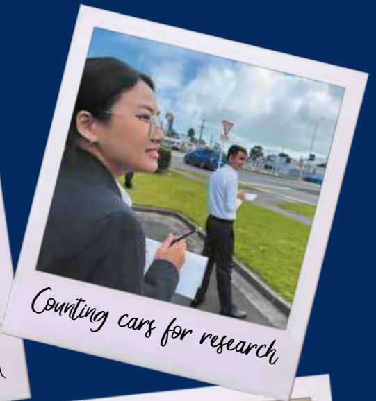
Counting cars for research