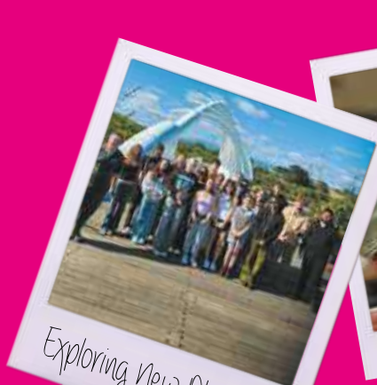
Exploring New Plymouth

Register https://pihms.ac.nz/events/careers-week/