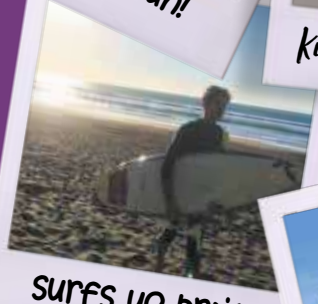
SURFS UP BR!