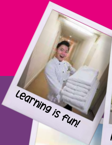
Learning is fun!