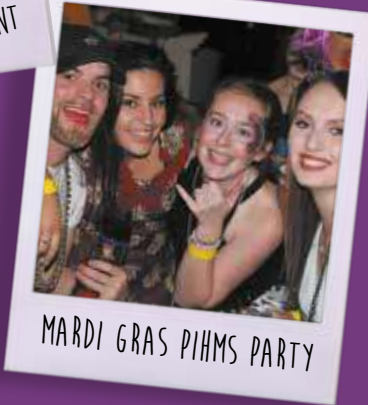
MARDI GRAS PIHMS PARTY