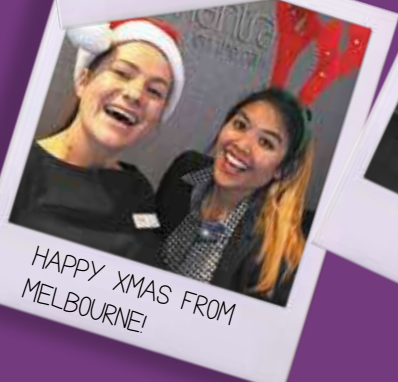
HAPPY XMAS FROM MELBOURNE!