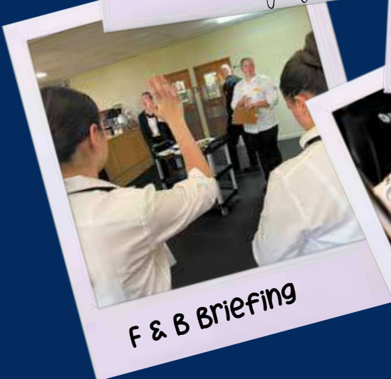
F & B Briefing