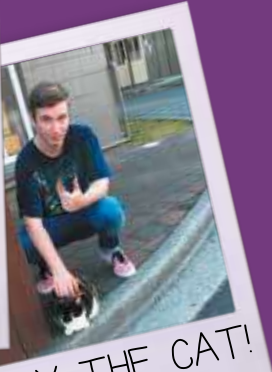
PIHMSY THE CAT!