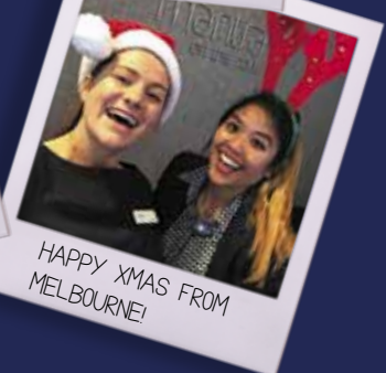
HAPPY XMAS FROM MELBOURNE!