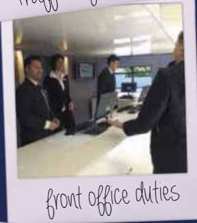
front office duties