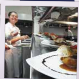
dinner time at PIHMS