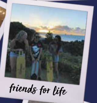
friends for life