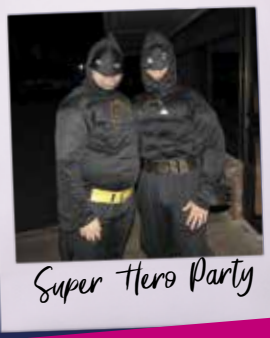
Super Hero Party