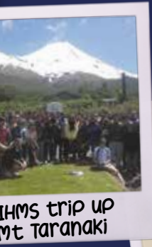
PIHMS trip up Mt Taranaki