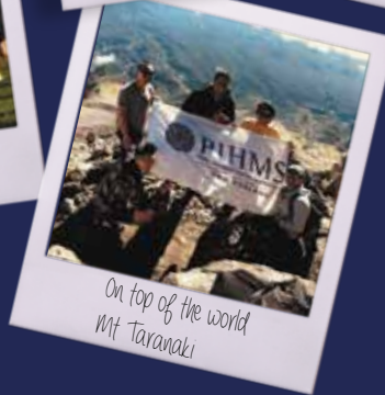
On top of the world Mt Taranaki