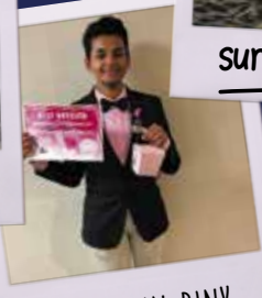
DRESSED IN PINK