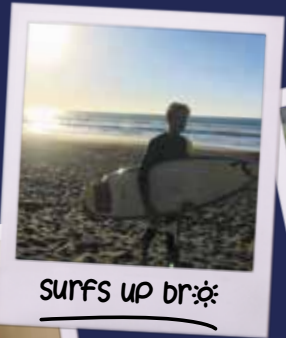
surfs up bro