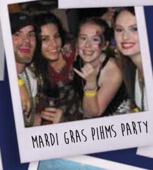
MARDI GRAS PIHMS PARTY