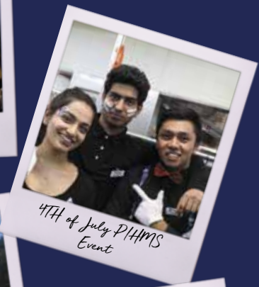
4th of July PIHMS Event