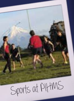
Sports at PIHMS