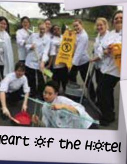
heart of the Hotel