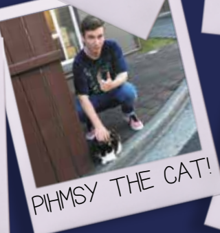
PIHMSY THE CAT!