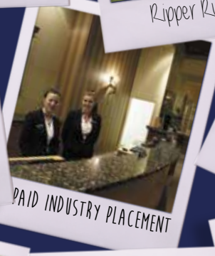
PAID INDUSTRY PLACEMENT